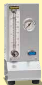
Gas supply system for non-flammable protective or reactive gas