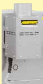
Chimney with fan